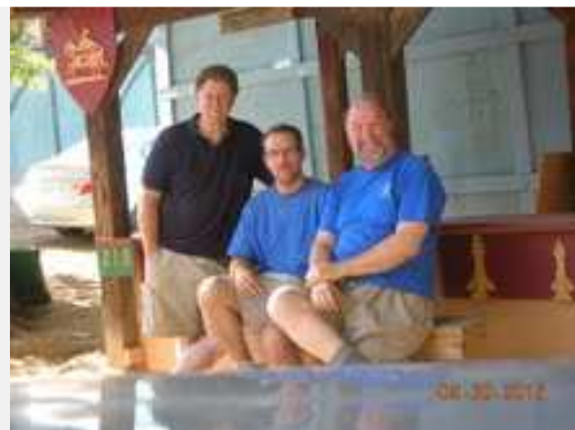
A couple of pictures of work on the new booth